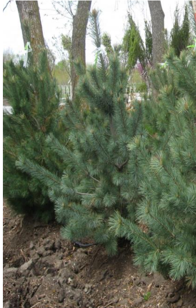
PINE, Limber Slow & irregular grower. Cold & drought tolerant (45'x30')

5'-6' $165 6'-7' $195 7'-8' $215 8'-9' $265