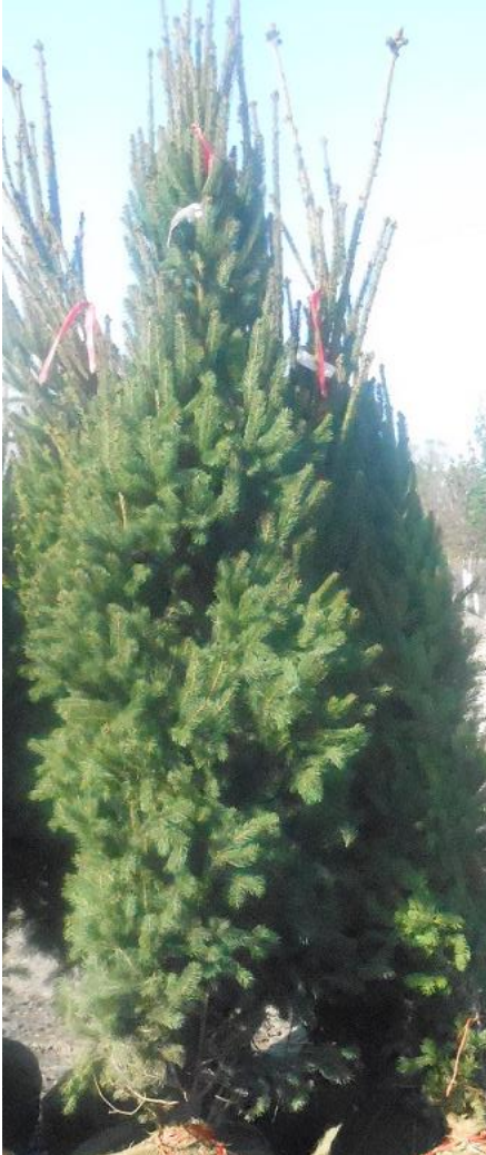
SPRUCE, Fastigate Norway A slender, uniform Norway Spruce with dark green needles. Fast grower. Prefers moist well drained soil. (40'x6')