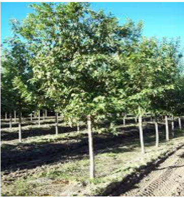
MAPLE, Amur "Flame" This dense & compact in habit tree is grown in single or clump (bush) versions. It has bright scarlet Fall foliage & is used in borders & small group plantings. (20'x15')