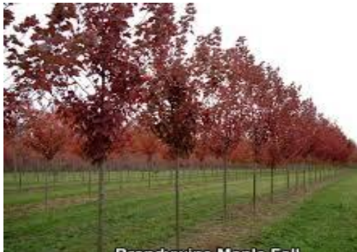
MAPLE, Brandywine This Red Maple has long lasting Fall color & ranges from a brilliant red to re-purple color Oval in branching habit. (40'x25')