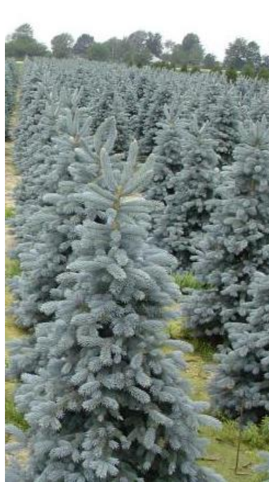
SPRUCE, Hoopsi A dense pyramidal very blue conifer. A vigorous plant that grows in full sun & rich moist, well-drained soil but adapts to a wide range of soil types (40'x15')