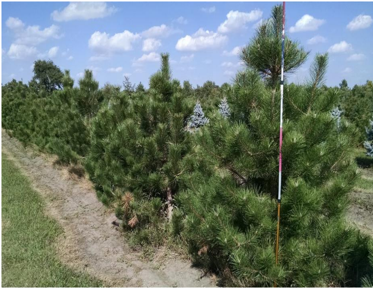
PINE, Austrian Darkest green of all the pines. Heavy, long needles with strong "Northwoods" fragrance. Vigorous, dense grower. Tolerates heat, cold & drought. (55'x30')