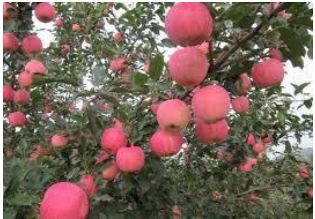
APPLE, Fuji A spreading apple that prefers well drained soil. Exceptional eating quality for salads. Rome & Braeburn are good pollinizers (10'x10')