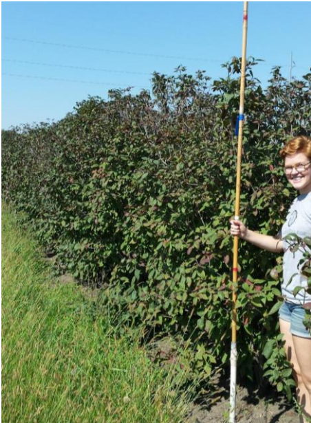
7'-8' Wentworth - Summer