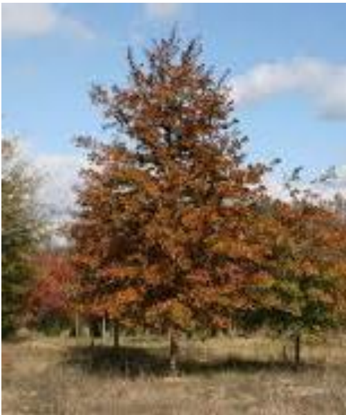
OAK, Northern Pin A pyramidal form with horizontal branching, rounded with age Tolerant of urban conditions, especially drought. Orange to red Fall color (55'x40')