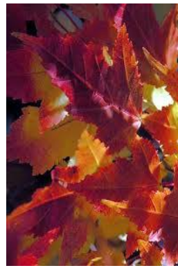
MAPLE, Compact Amur This smaller version has smaller leaves with a brilliant fall color (10'x10')