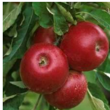
APPLE, Jonathan Medium sized apples with a sweet-tart tast Perfect for pies (20'x10')