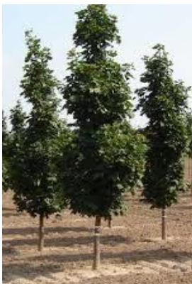
MAPLE, Columnar Norway This is a narrow upright tree with ascending branching Green in Summer, yellow in Fall (35'x15')