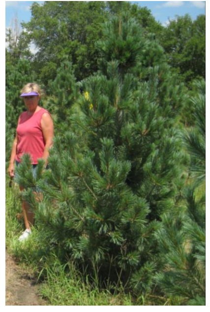
PINE, Vanderwolf A densely narrow pine Protect from wind (40'x20')