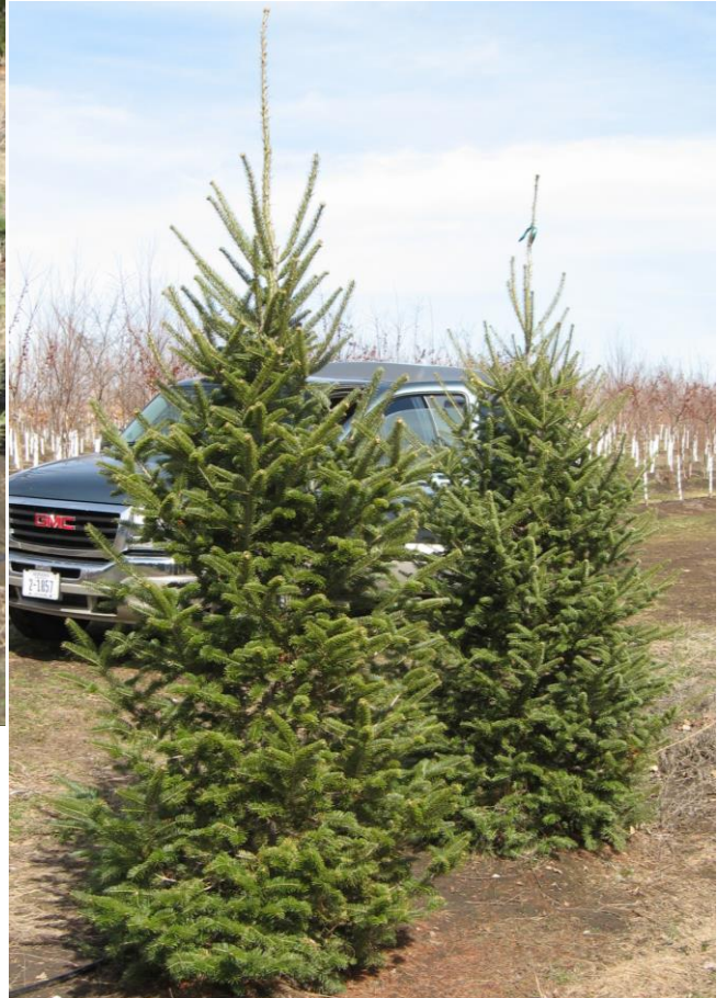
FIR, Cannan Fast growing with glossy dark green needles. It has a dense, pyramidal, slender atop habit & prefers cool, moist, well drained soil & to be out of direct wind. Fragrant foliage. (50'x25')