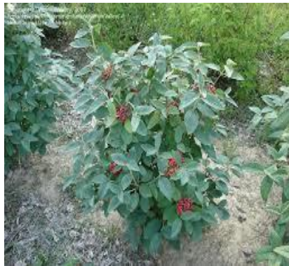
Mohican - Late Summer