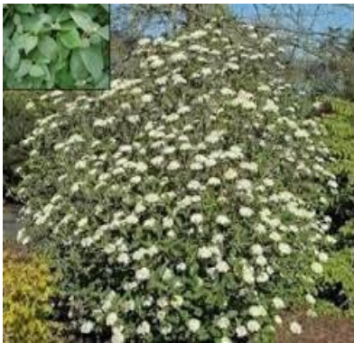
Mohican - Spring