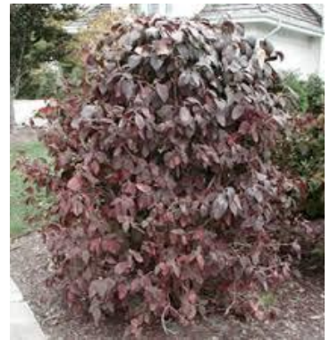
Mohican - Fall

VIBURNUM, Lentago Larger, upright, multi-stemmed, grows to 10'-18' tall with a spread of 6'-12'. Non-freagrant white flowers appear in Spring. Flowers give way in Fall to blue-black berries.