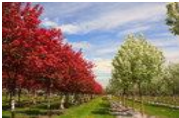
Purple Prince & Springsnow

Zumi Redbud - This crab blooms red buds opening to pink flowers & fading to white.