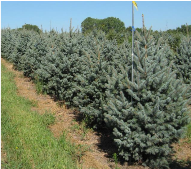
SPRUCE, Bakeri A deep blue form of Colorado Spruce, pyramidal shape & horizontal branches Perfers sandy loam soil but will adapt (30'x15')