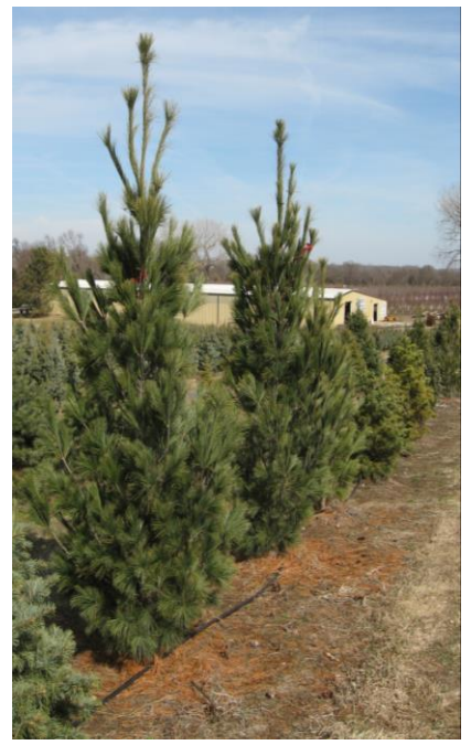
PINE, Fastigate White A narrow white pine with long bluish green soft needles (30'x10')