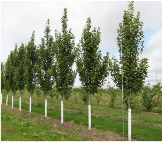
MAPLE, Armstrong A narrow fastigate Maple with light green foliage turning yellow to orange-red in the Fall. A rapid grower but perfect for lining driveways & narrow yards. ( 45'x15') Avg hgt: 2" - 12' 3" - 15' 4" - 20'