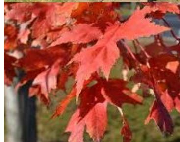
MAPLE, Autumn Blaze This Maple & the Sienna Glen Maple are a cross between a Silver Maple & a Red Maple (Freemani ) With this hybrid a rapid growing tree with great Fall colors is achieved. These tree have an upright, oval branching structure that keeps them less adapt to wind damage & a unified shape. The Fall colors can range from yellow-orange to orange-red. (50'x40') Avg hgt: 2" - 10' 3" - 15' 4" - 20'-22'