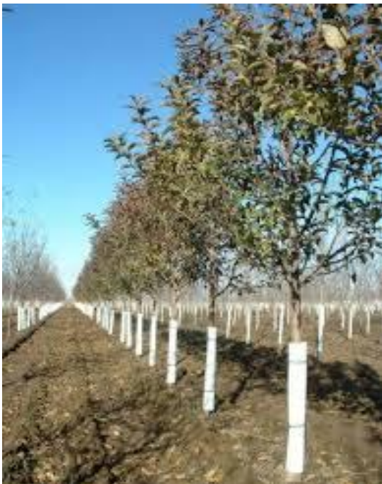
APPLE, Yellow Delicious An oval, spreading, but upright apple with large golden yellow fruit. Needs to have a pollinizer. (25'x25')