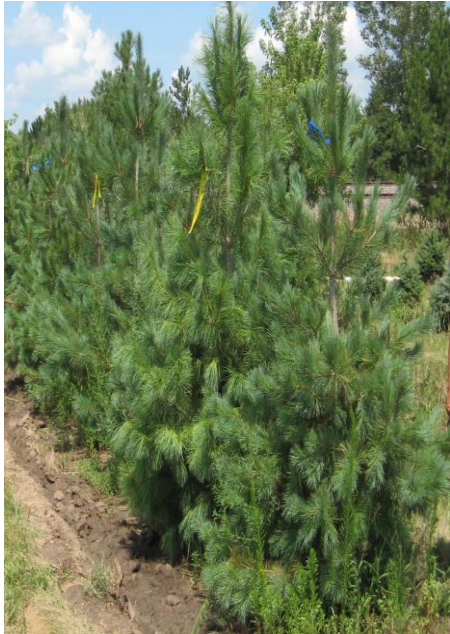
PINE, Southwestern Long & cylindrical cones Resists winter yellowing. (40'x20')

5'-6' $165 6'-7' $195 7'-8' $215 8'-9' $265