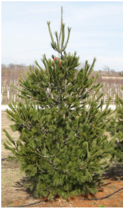
PINE, Eastern White A large species with soft blue-green needles & grayish bark (80'x40)