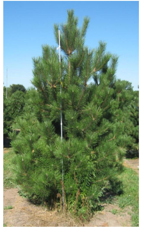
PINE, Ponderosa When young this conifer's shape varies from a narrow to broad pyramid. With age, the species develops a narrow crown with short thick lateral branches. Loses lower branches as it ages. Needles are dark green to yellowish-green. Plant in full sun in moist, well-drained soil Adapts to dry & alkaline sites. (60'x25')