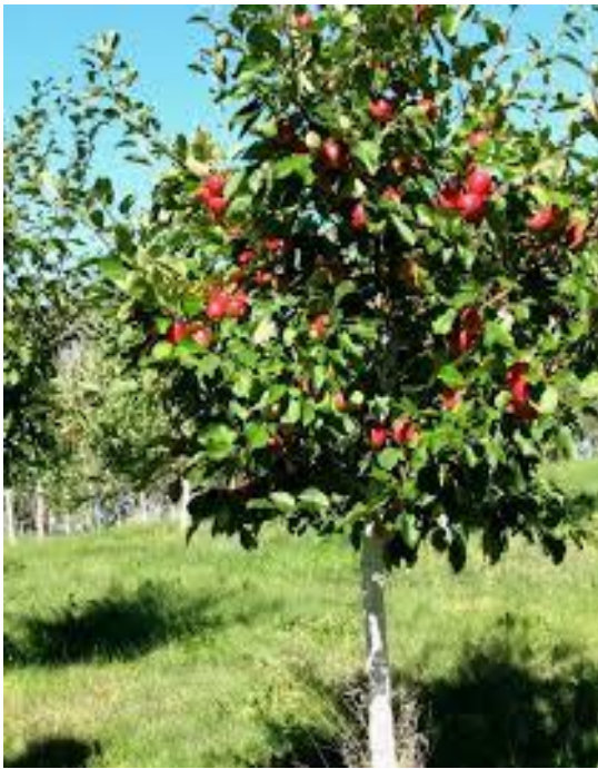
APPLE, Honey Crisp An upright spreading Apple with juicy, crisp, eating & baking apple (20'x20')