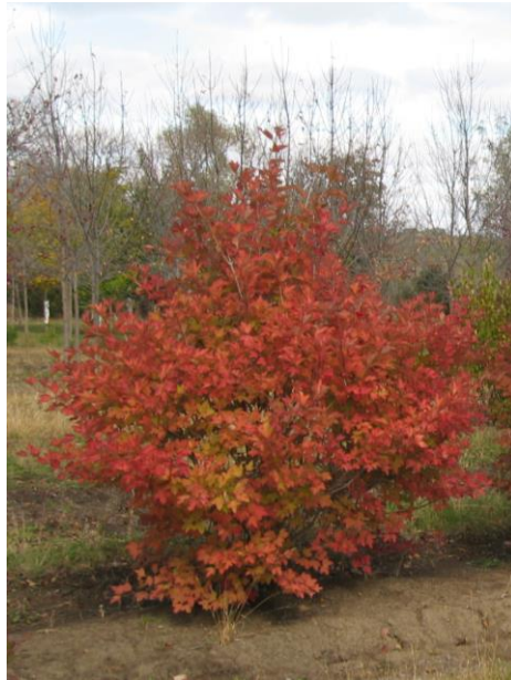
7'-8' Wentworth - Fall