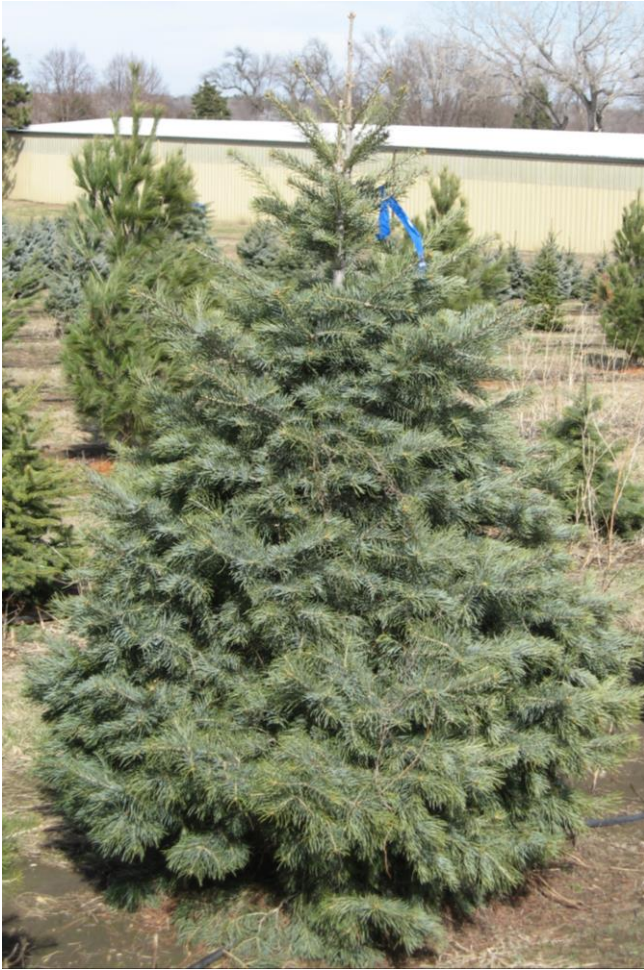
FIR, Concolor This conifer has bluish gray-green foliage with a conical symmetric habit with tiered branches. Prefers sandy loam soil with full sun to light shade (40'x25')