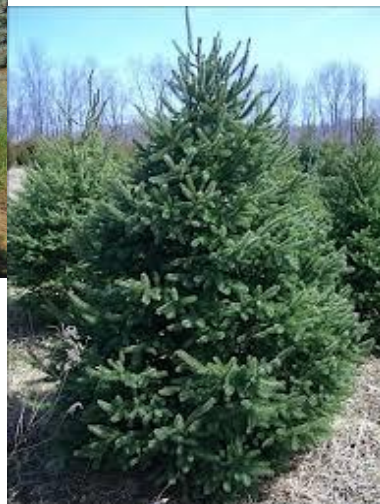
SPRUCE, White A conical large Spruce with pale green needles. A slow to moderate grower. Is adaptable to many soils (50'x20')