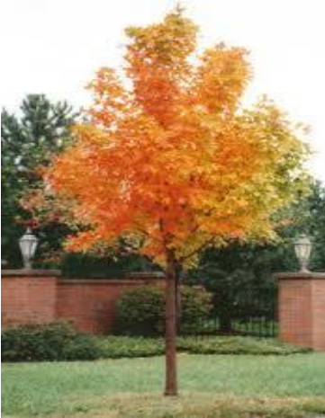
MAPLE, Pacific Sunset This mid-sized tree has an upright, spreading form. Glossy green summer foliage turns bright yellow-orange-red in Fall (30'x25')