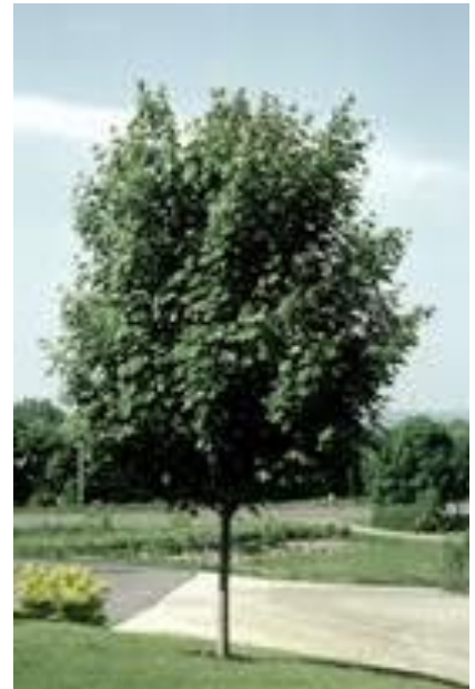
MAPLE, Emerald Lustre Norway - This large Maple has a round oval shape & immature foliage displays an attractive red tinge before maturing to glossy deep green leaves turning bright yellow in Fall (50'x20') Avg hgt: 2" - 10' 3" - 15' 4" - 20'