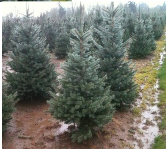
SPRUCE, Baby Blue Eyes A smaller species of Spruce with a wide tolerance to difference soil A slow grower, perfect for smaller yards (20'x10')