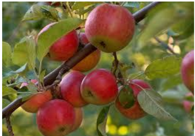
APPLE, Macintosh An upright, oval Apple Best known for applesauce, pies & cider A early heavily producing tree (20'x10')