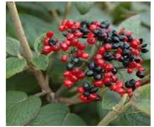
Viburnum berries in late summer