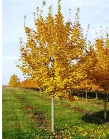
MAPLE, State Street Upright Maple with dark green leaves turning yellow in Fall. It has a corky bark & is rapid grower (50'x35')