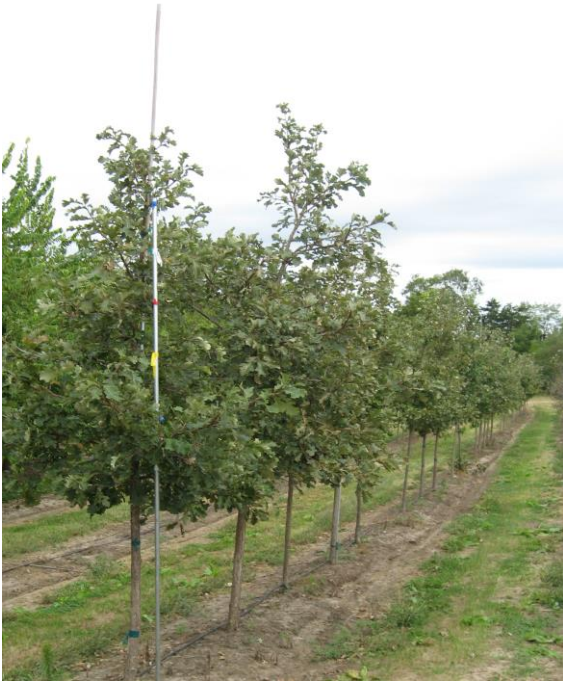
OAK, Bur This large & impressive native to Nebraska tree has a thick trunk & corky branches. Broadly oval, irregular & open in habit. Green leaves turning yellowish-brown in Fall (55'x45')