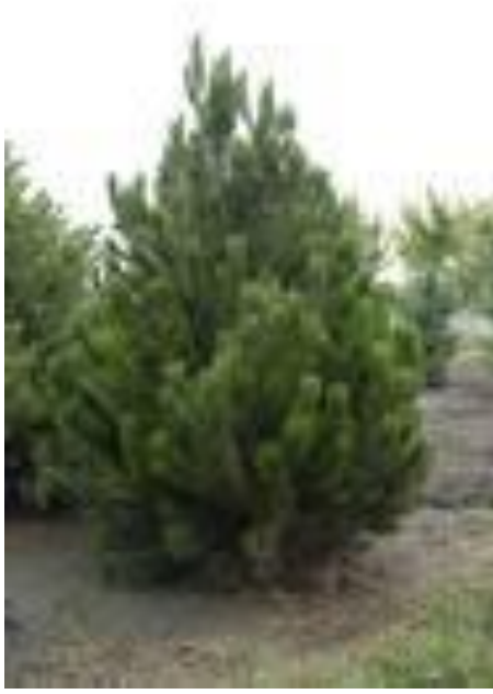
PINE, Bosnian A dense narrow dark green with upright branching. Slow grower (40'x15')