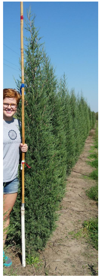
JUNIPER, Taylor A narrow fast growing juniper native to Taylor, NE. Blue-green foliage turning brownish in Winter. Makes a great privacy screen, entrance or a dramatic vertical element to a landscape (30'x3')