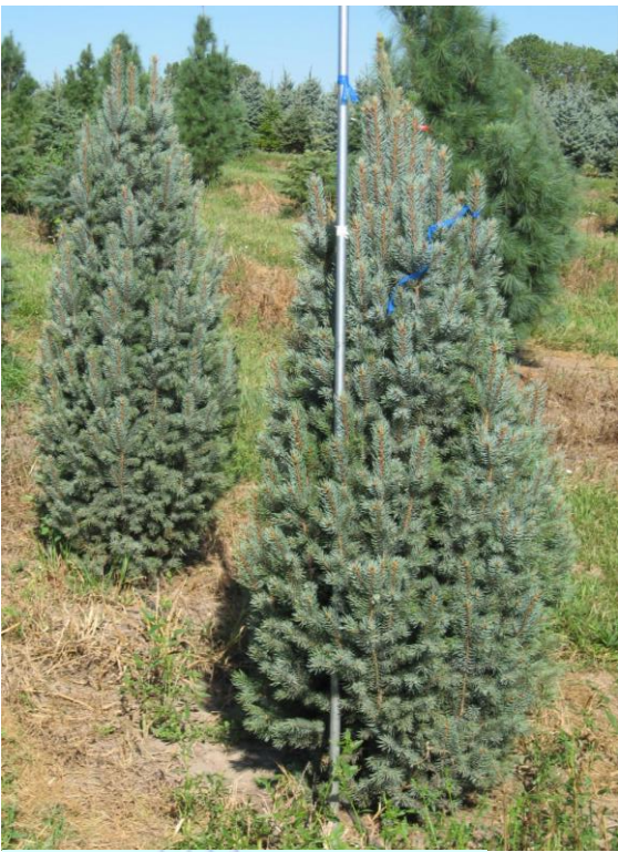
SPRUCE, Fastigate Colorado Spruce A narrow dense blue Colorado Spruce. (35'x10')