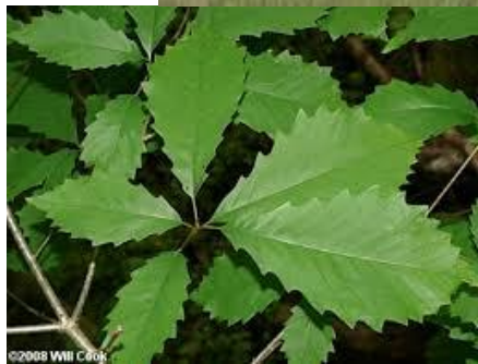
OAK, Chinkapin A sturdy fast growing Oak with large sharp-toothed leaves. Fall color yellow-orange-brown with a white cast to the underside. Rounded & open in habit ( 45'x45')

Avg hgt: 2" - 10'-12' 3" - 14'-15' 4" - 18'-22'