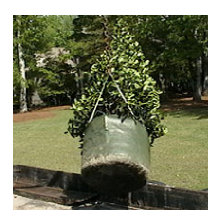
Step 1 - Lace lift loops in star fashion to provide easy handling of wire frame once fabric sides and bottom are removed