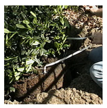
Step 5 - Remove star lacing and bend lift loops down inside planting hole.

Resulting top 4-5 inches of unobstructed side surface allows stabilization root growth to grow uninhibited into surrounding soil.