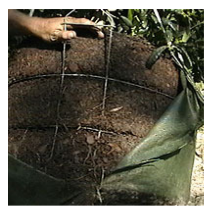
Step 4 - Lift plant away from fabric and place in planting hole with wire basket intact.

For machine lifting, attach chain hook where star lacing crosses.