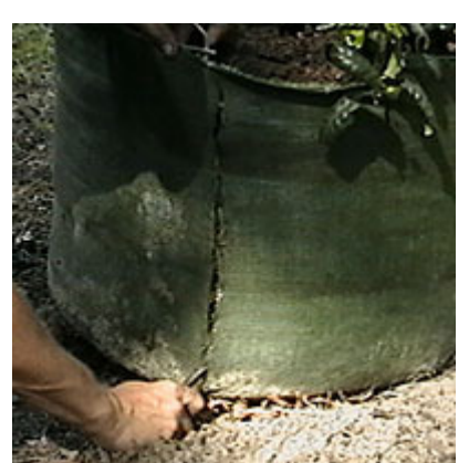
Step 3 - Vertically slit and pull down side fabric from top horizontal wire close to bottom horizontal wire.

Fanntum's top horizontal wire easily pulls down with planter fabric, leaving lift loops intact and laced for easy moving of plant container.