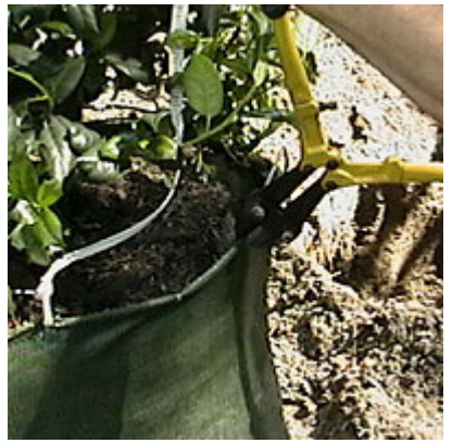
Step 2 - Use wire cutters to cut top horizontal wire both left and right of each nursery container lift loop.